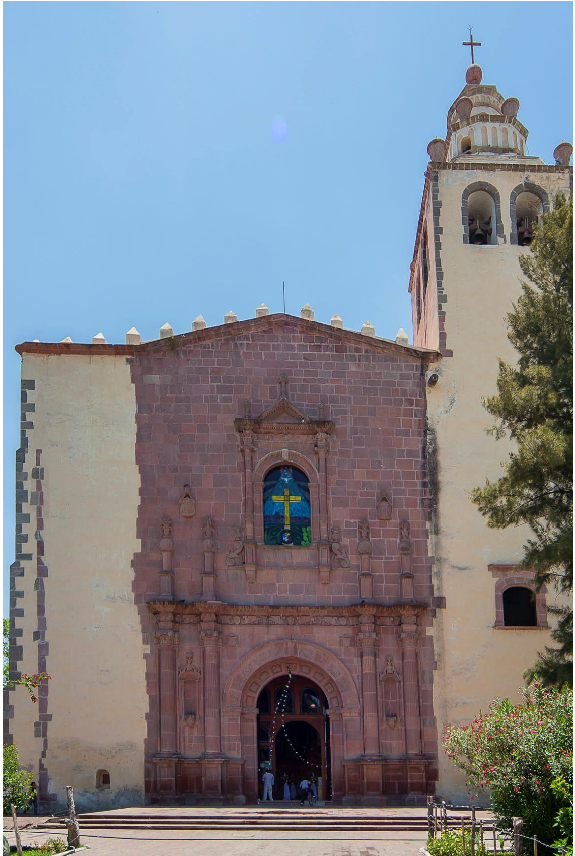
Plate 2. The temple of San Miguel Arcangel Ixmiquilpan. Photograph by José Luis Pérez Flores, 20 May 2006.