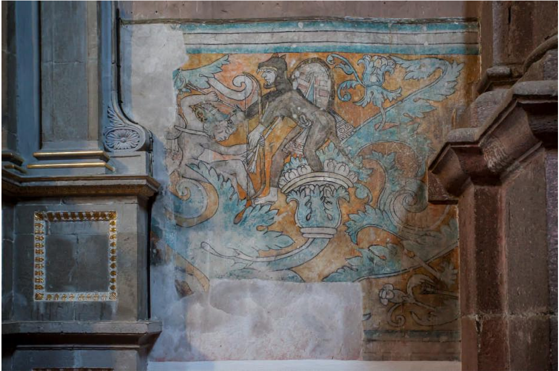
Plate 3. An anthropomorphic warrior subduing a 'wild' Chichimeca. Mural painting inside Ixmiquilpan church.

We knew that the desire to make alterations to historical monuments or paintings was nothing new. As part of the history of many places in the world, buildings experience alterations and modifications, and their uses change with time. Therefore history is always something that is viewed from the present. As we noted in the previous section, rulers of pre-Hispanic empires used the narratives of the past as a means of legitimation in their present circumstances, altering facts and modifying them for political purposes. As the Italian historian Benedetto Croce argues, 'The practical requirements that underlie historical judgment give to history in general a character of "contemporary history"; it does not matter how far away in time those past deeds might look, history in reality relates to the present needs and situations in which the facts reverberate' (Croce 1992: 11). In the twentieth century, the symbolism that places occupy in the social imaginary of people foments the modification of façades, the alteration of motives, and in cases like warlike intervention, the complete obliteration of edifices and historical monuments. Intervention could be violent or symbolic. Places located at the centre in one period may change to the periphery, a theme Iuri Lotman has probed in his semiotics of culture (Lotman 1996). What was regarded as meaningful