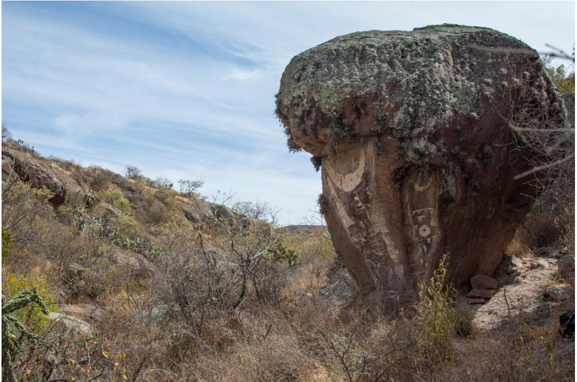
Plate 4. Cave painting in Huichapan, Hidalgo.