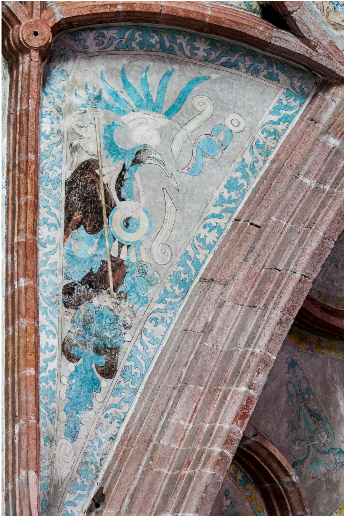
Plate 6. Original eagle from the presbytery of Ixmiquilpan church.