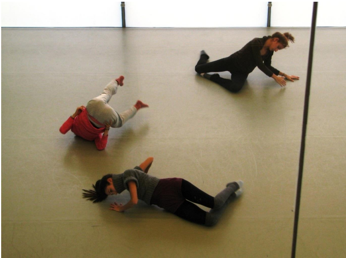
Figure 1. Dancers in daily training (photo by Stanley Ulijaszek, reproduced with permission).

The images below capture two very different representations of bodies in their social and cultural contexts: