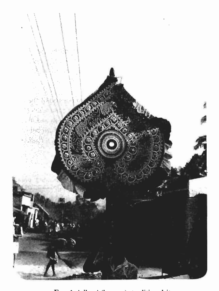
Fig. 1 Adheni (banner), traditional item

door hangings may be seen generally in traditional Oriya households. The success of the batua in former times has given an impetus to the production of various types of ladies' bags in appliqué, which are very much in demand and circulate widely in India as well as abroad. The garden umbrella has an immense demand around the world and can be seen decorating beaches and the lawns of private houses both in India and abroad. It provides protection from the sun but not the rain. Fancy appliqué hand-fans are also made.