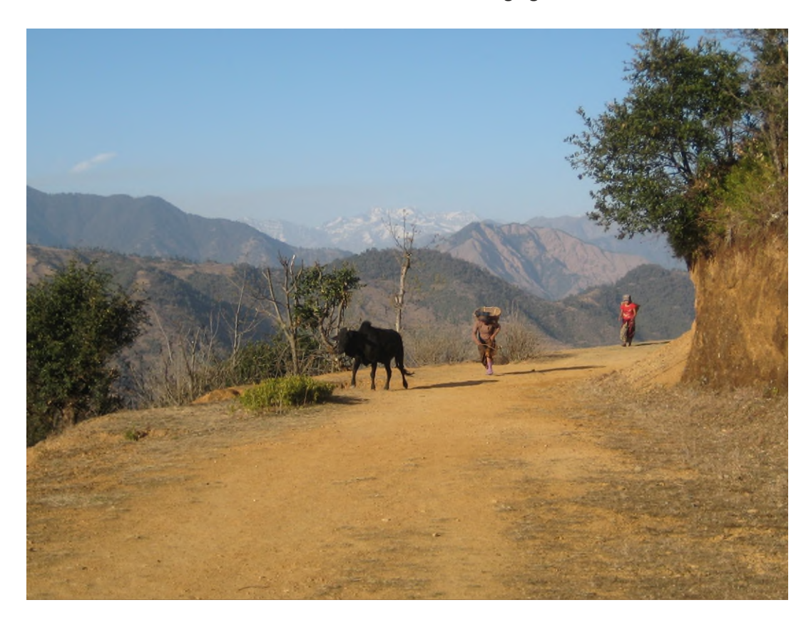
Ina Zharkevich: Kham Magar women returning home from the jungle, mid-Western Himalayas, Nepal, 2011.