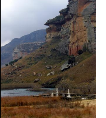
The Van-Reenen Family Cemetry, Golden Gate Highlands National Park